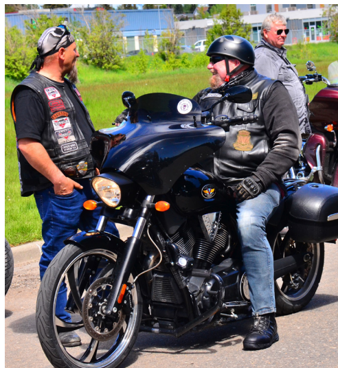
Ran into old friends like Jumpmaster.