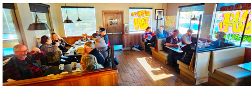
Breakfast at Denny's before the event.