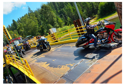
Boarding the ferry MV Osprey