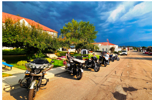
Ominous clouds as we landed at the Thai restaurant in downtown Creston.