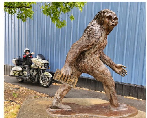
Drifter catches a beer thief