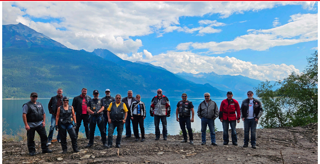
We were suprised to find the Highway 31 pavement went past the head of Kootenay Lake, providing us with even more curves and great scenery.

The ride home was eventful for some. It included a CF-18 fighter flypast and a Subaru rollover that Woodie attended.