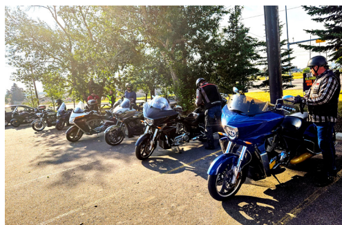
Seven members took off from Calgary, picking up more along the way and at the museum.