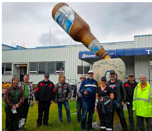
Brewery tour group