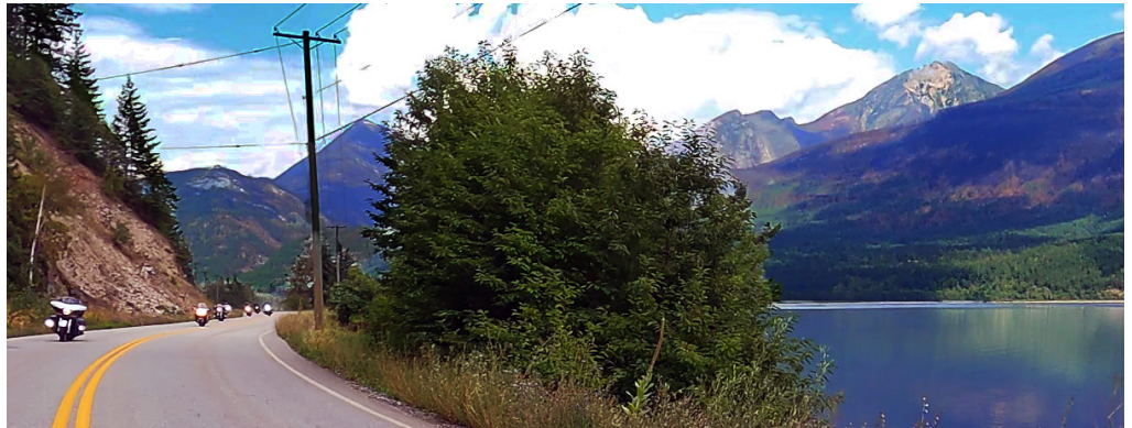
Kaslo Kurves this year included some new-to-us roads. The group rode north of Kaslo on Highway 31 to the head of Kootenay Lake, finding more curves.