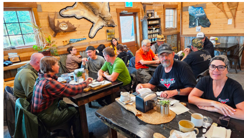
The popular Mountain Barn