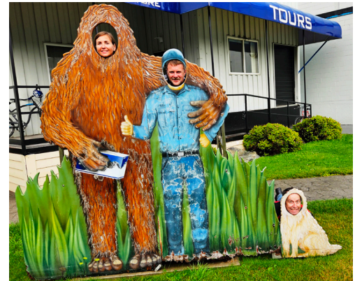
What happens in Creston....