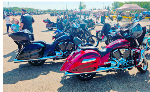
The Ride to Reynolds was a gathering point for Victories. Maybe our future Meet in the Middle?