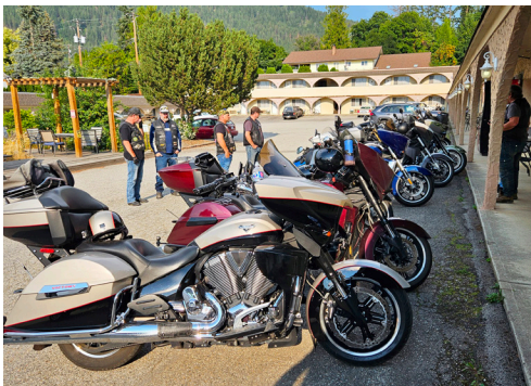
The Magnuson Hotel was ride central, even for those who camped.