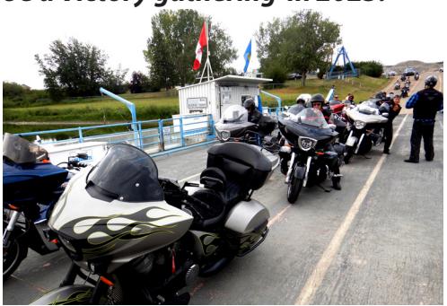
Meet in the Middle riders hit the Bleriot ferry north of Drumheller.