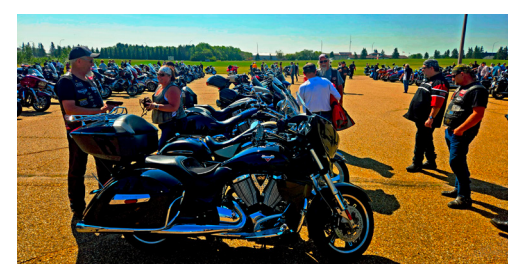
The Ride to Reynolds will officially be a Victory gathering in 2025.

One of the ideas tossed around was a display similar to what VRC did at Two Wheel Sunday in Calgary two years ago. In addition to a display of Victory artifacts and regalia, every model of Victory motorcycle ever made (except one) was on display. The bikes were tagged with the model, year and other information. The display became a popular social gathering area during the event.